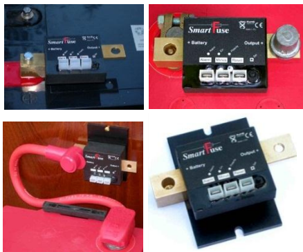
SmartFuse + Mounting Plate